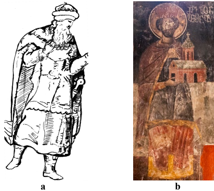
Figure 2. Comparison of Castelli clothes and Georgian fine arts' sources

Note: a – the clothes of the King of Imereti; b – Levan King of Kakheti's clothes from the painting of Gremi Temple