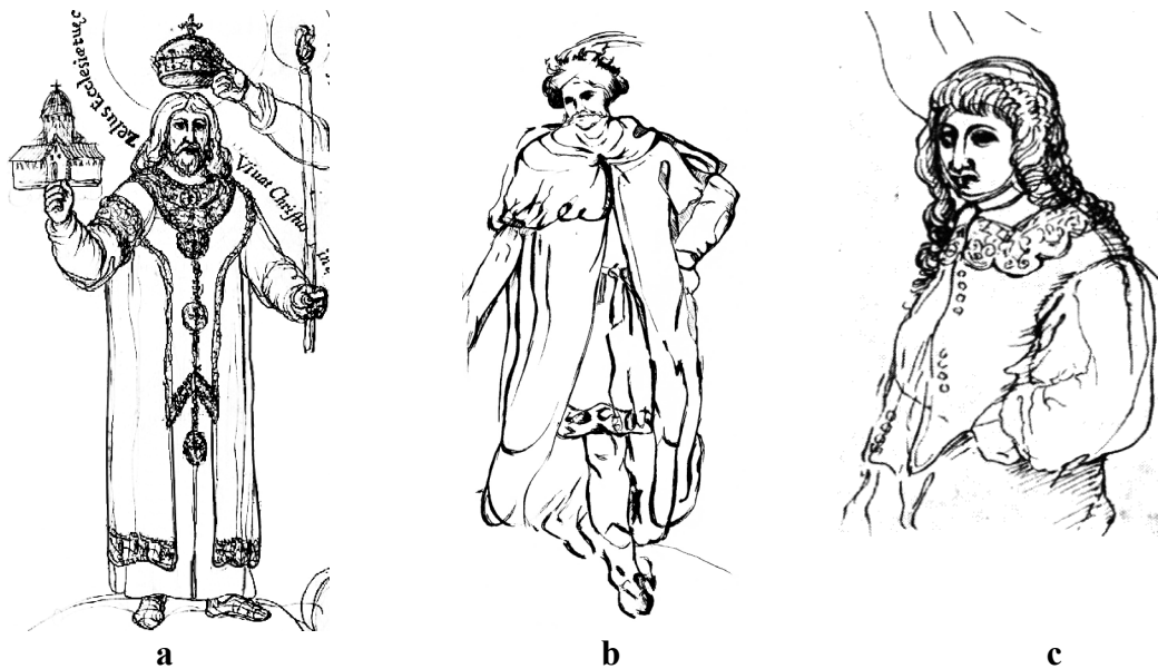
Figure 3. The clothes of kings and princes

Castelli's royal and nobleman costume includes an inner dress and an outer bison, or an inner dress and mantle-cloak and various headgear. We can find in both short and long dress (Figure 3, a, b).